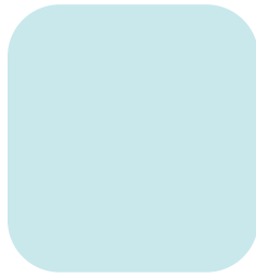
Prairie Trail Light Blue 20.0.7.0