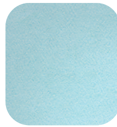
PT Texture background secondary use

Accent colors should be used to attract attention to headlines and subheads or complement imagery used in communication materials. The orange is primarily used as a pull-out color for special events.