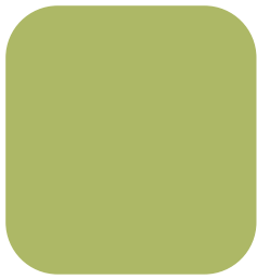
Prairie Trail Green 36.16.75.0