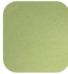
PT Texture background use